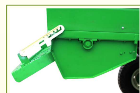
Straw Management System